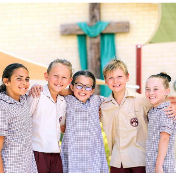
St Simon Peter Catholic Primary School, Ocean Reef

All in Catholic education are called to relate personally with Jesus Christ by modelling Christ through a faith lived out in words, actions, relationships and values. Jesus' teachings and Gospel values are the educational norms that permeate Catholic school life as each member of the community strives to give Christian witness.