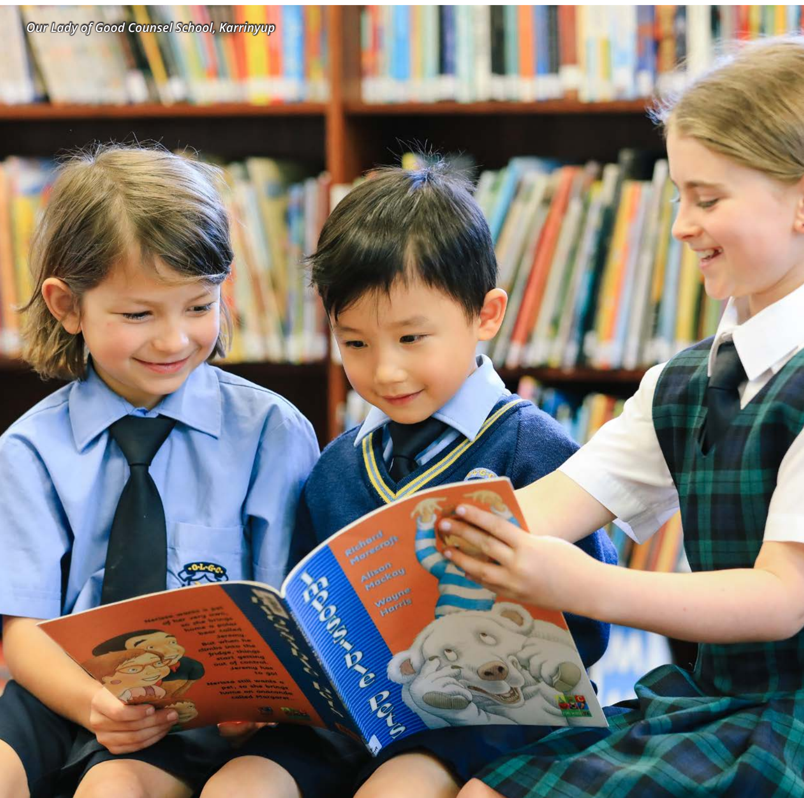
Our Lady of Good Counsel School, Karrinyup