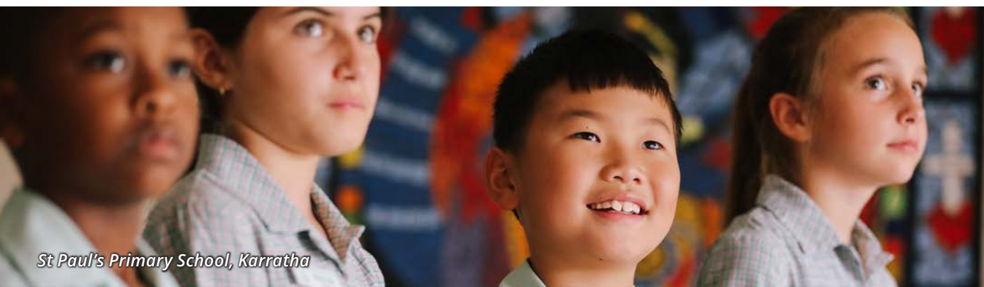
St Paul's Primary School, Karratha