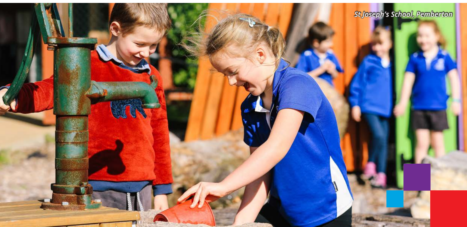
St Joseph's School, Pemberton