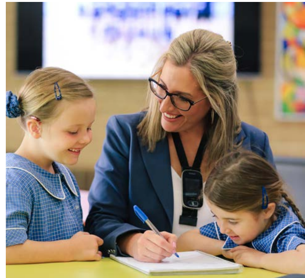
St Luke's Catholic Primary School, Woodvale; Mater Dei College, Edgewater

Learning to integrate faith, life and culture will enable children and young adults to develop a Gospel vision of the Australian and global communities. This integration of faith, life and culture is possible when schools integrate the truths and values of the Gospel in educationally appropriate ways into everything students learn and experience.