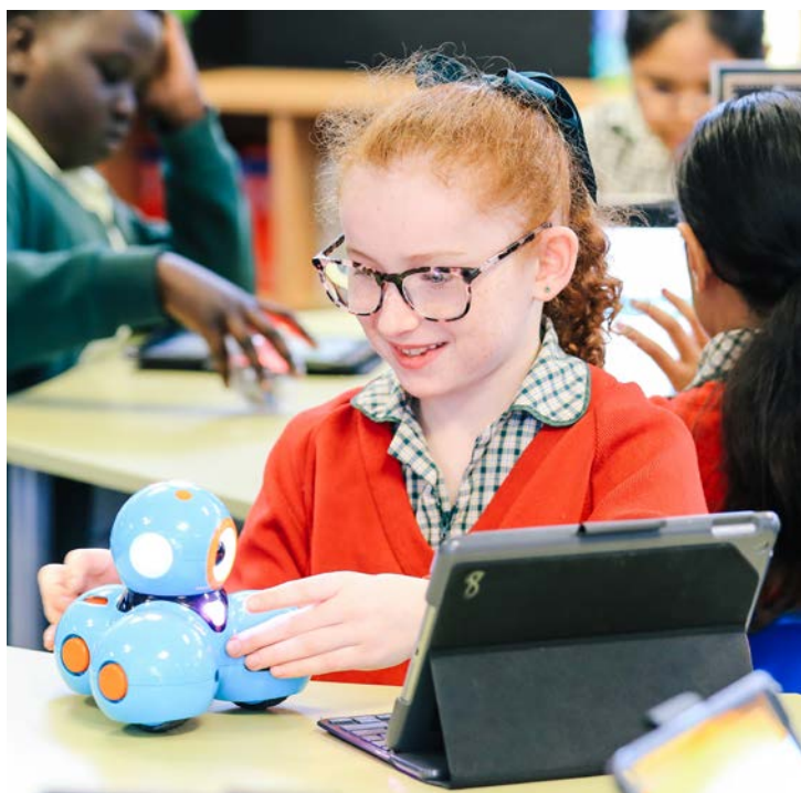
St John Paul II Catholic Primary School, Banksia Grove

The Vision for Learning is aligned to the domains of CECWA's Strategic Directions 2019–2023 and the CEWA Quality Catholic Education Tool .