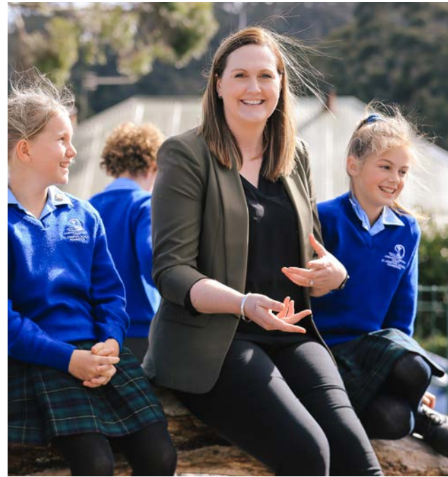
St Joseph's School, Pemberton