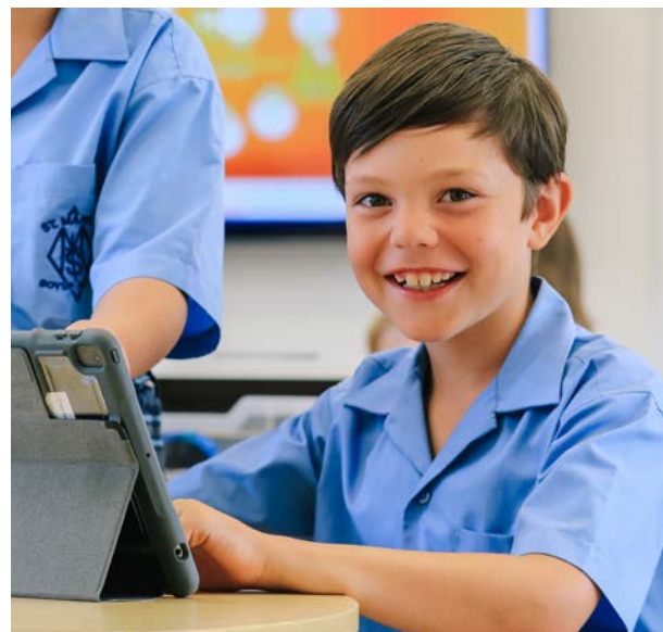
St Mary's Catholic School, Boyup Brook