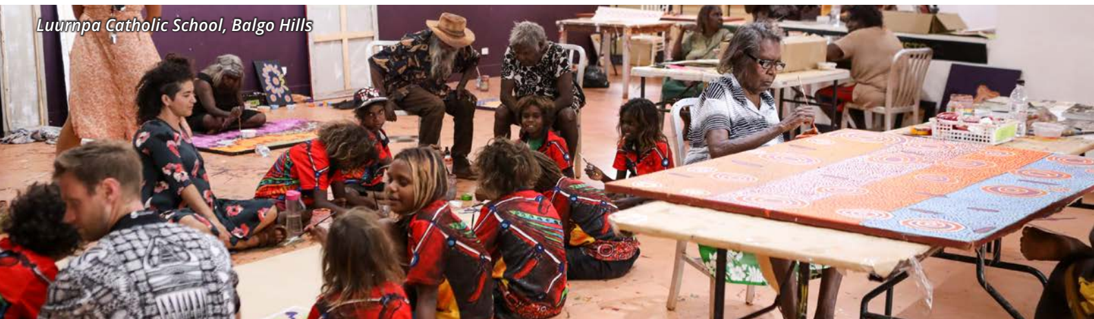
Luurnpa Catholic School, Balgo Hills