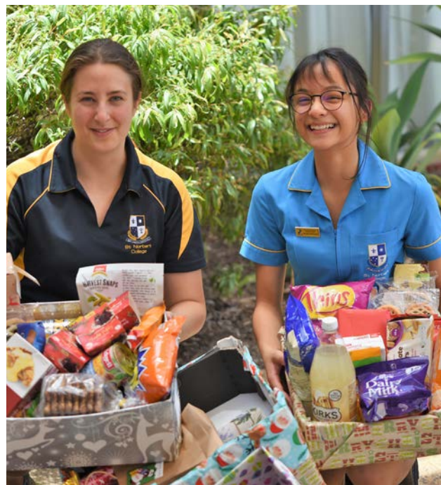
St Norbert College, Queen's Park